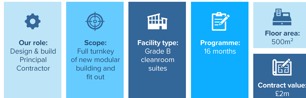
Royal Marsden Hospital, Surrey