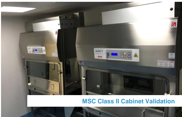
MSC Class II Cabinet Validation

Enbloc are also completing the validation of the Microbiological Safety Cabinets, Fume Cupboards and Laminar Flow Cabinets.