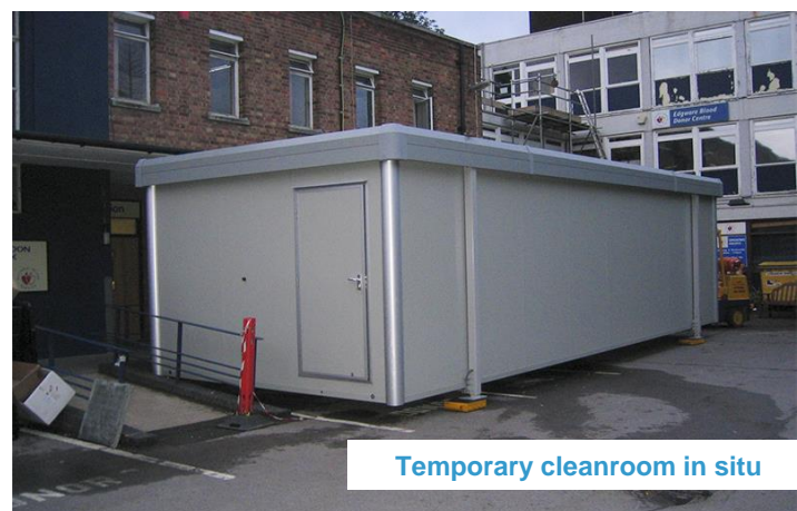
Temporary cleanroom in situ