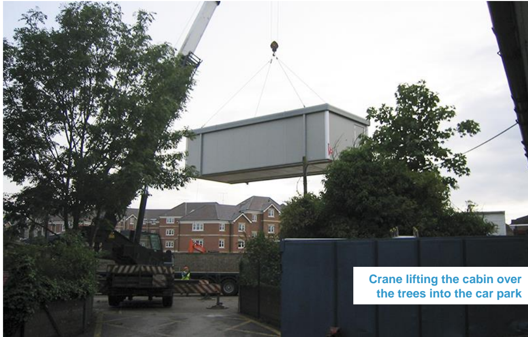
Crane lifting the cabin over the trees into the car park

Installation of temporary portable cleanroom to allow critical processes to continue during building upgrade work