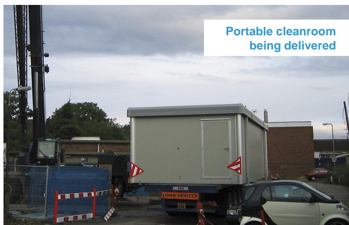
Portable cleanroom being delivered

After the main project was complete, the portable cleanroom and link corridor were removed and the car park restored to its original condition.