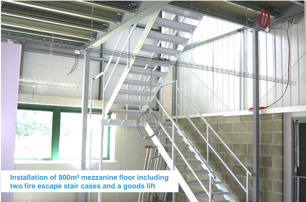
Installation of 800m 2 mezzanine floor including two fire escape stair cases and a goods lift

Major private sector pharmacy manufacturing unit