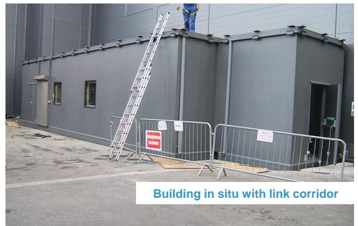
Building in situ with link corridor

For more information on the clean facilities that Enbloc can offer please visit our website www.enbloc-cleanrooms.com or contact our head office on +44 (0)1252 626229 or email us at sales@enbloc-cleanrooms.com