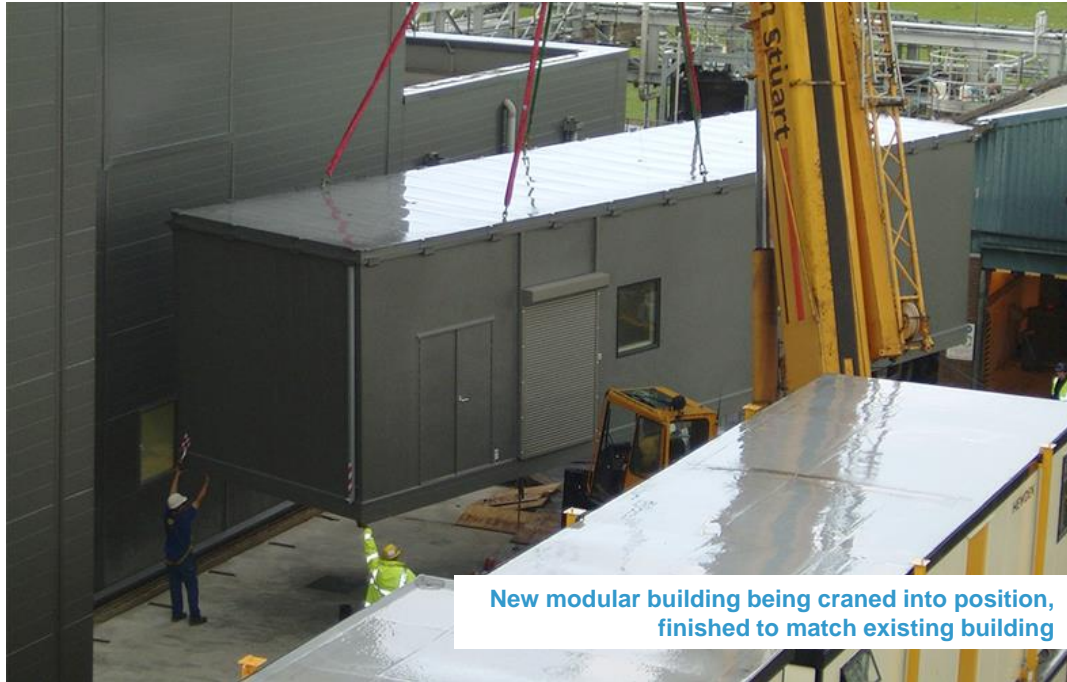
New modular building being craned into position, finished to match existing building

Custom-made extension to meet client's exacting requirements for seamless integration into existing facility