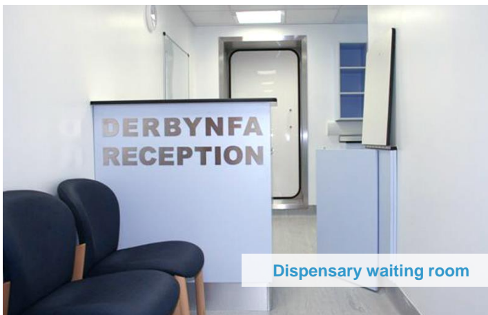
Dispensary waiting room