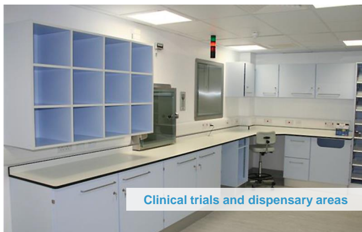
Clinical trials and dispensary areas

Enbloc’s Validation Team carried out rigorous validation including design, installation and operational qualification. The facility was designed and built in accordance with the rules and guidance for pharmaceutical manufacturing and distribution 2007 and also MHRA requirements.