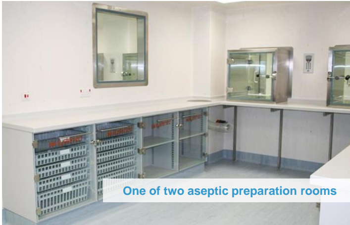
One of two aseptic preparation rooms