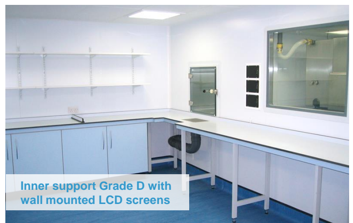
Inner support Grade D with wall mounted LCD screens