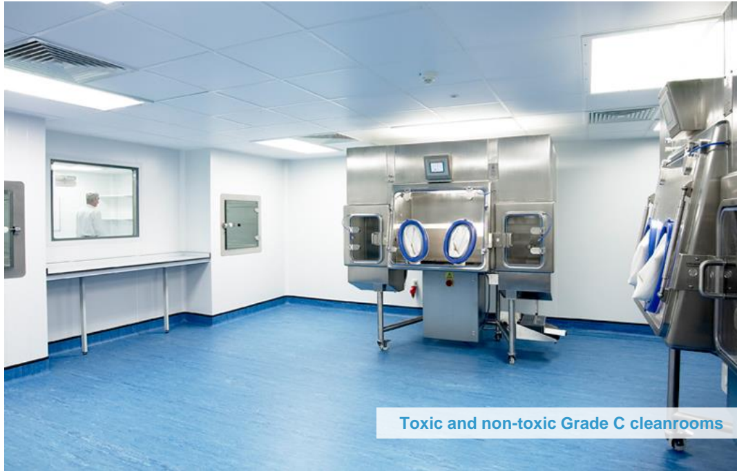
Toxic and non-toxic Grade C cleanrooms

Enbloc were selected to design and build a major new facility direct for the NHS Trust