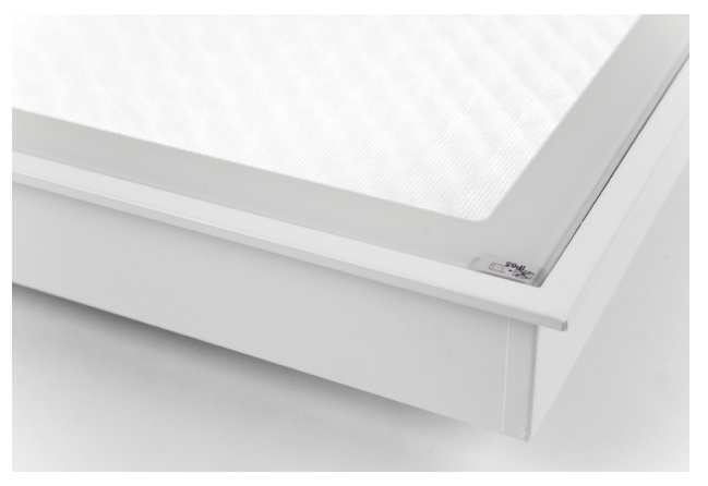
ENBLOC CLEAN LED SMOOTH MICRO-PRM